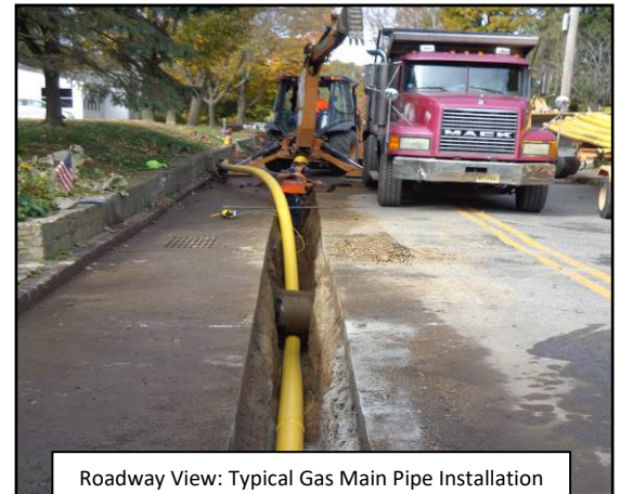
Roadway View: Typical Gas Main Pipe Installation