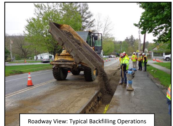
Roadway View: Typical Backfilling Operations