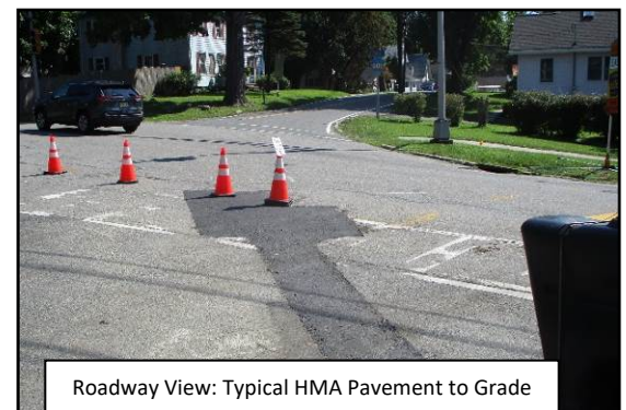
Roadway View: Typical HMA Pavement to Grade